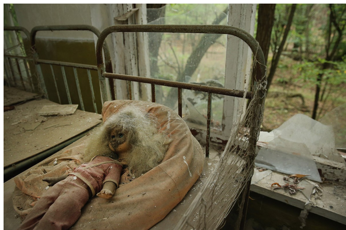
Chernobyl — abandoned town