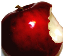
Knowledge and a Girl (The Snow White Case) by Howard Barker

14-17 & 21-24 February 2018 Kelvin Studio