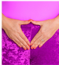
The Vagina Monologues by Eve Ensler

14-17 & 21-24 February 2018 Kelvin Studio